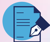
Various Offtake & Price Hedging agreements

BGE maintains a diversified supply portfolio to help manage price and production exposures