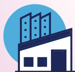
Whitegate 445MW CCGT