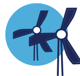
Offtake from various wind farms

BGE maintains a diversified supply portfolio to help manage price and production exposures